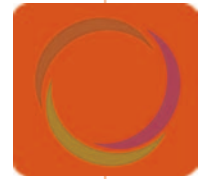
EXHIBIT 1: A SCHEMATIC FRAMEWORK FOR THE CREATION OF A SYSTEM FOR ETHICAL CONDUCT